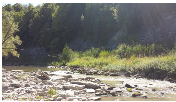
View of the river after walking through the North pit. Maybe 15 feet wide now and you could wade across without getting your shins wet. In the spring, the water is easily 2 feet higher.

humid, I gave up on fossilling and tried my luck at fishing, where I caught a couple of new (to me) species from the Ausable River to bring my species count for the year to 36. I left earlier than I had originally planned, but was still happy with how the day turned out.