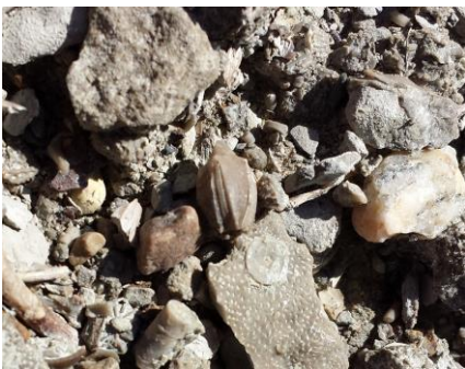
Hyperoblastus filosa blastoid as found