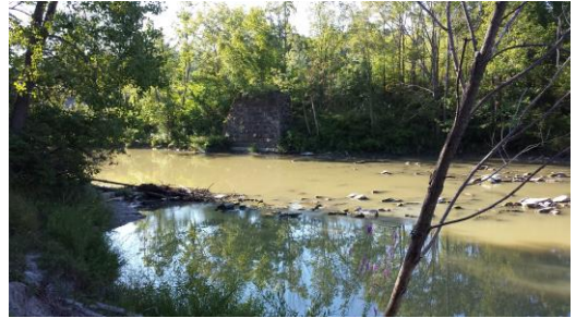
View looking South from old bridge. These rocks are normally totally submerged